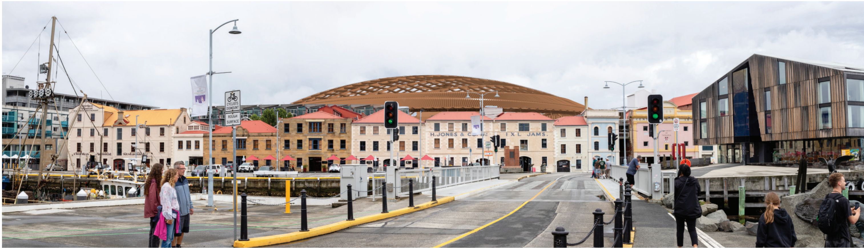
PROPOSED VIEW WITH STADIUM BUILT FORM