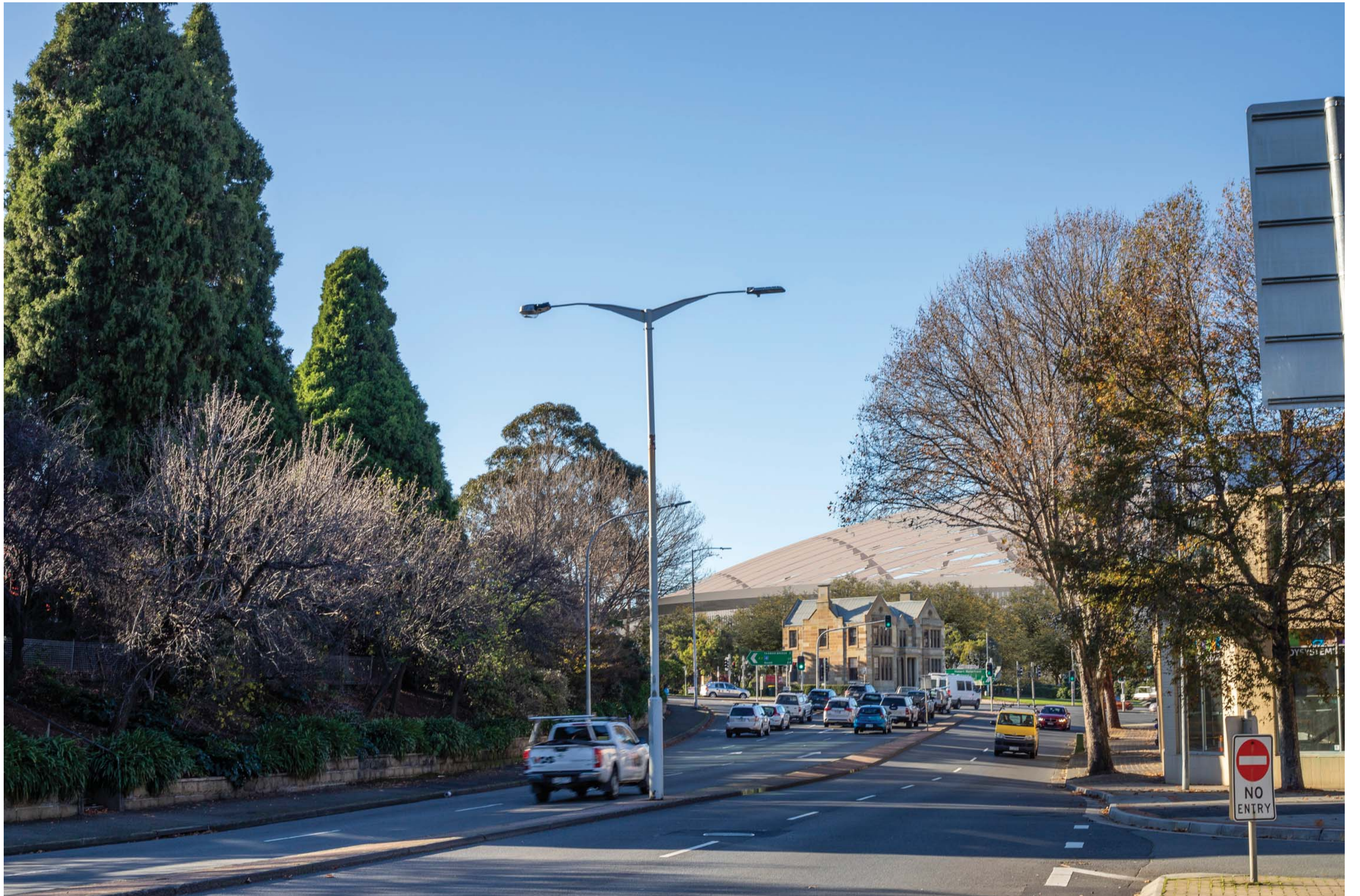
MAC POINT VIEW 2 BROOKER AVE PROPOSED DEVELOPMENT WITH PLANTING