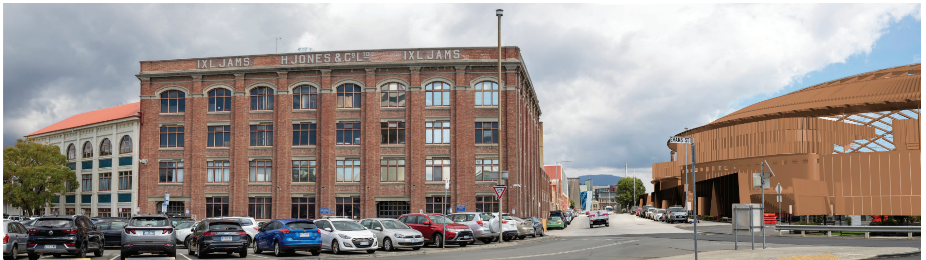
PROPOSED VIEW WITH STADIUM BUILT FORM