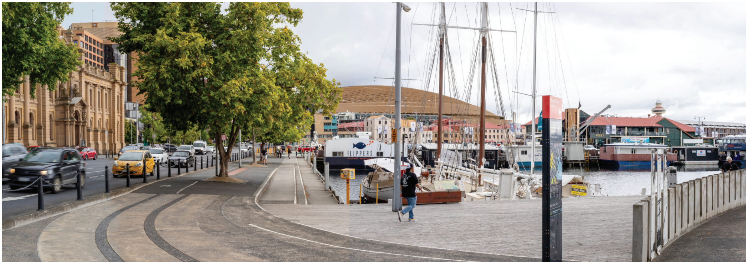
PROPOSED VIEW WITH STADIUM BUILT FORM