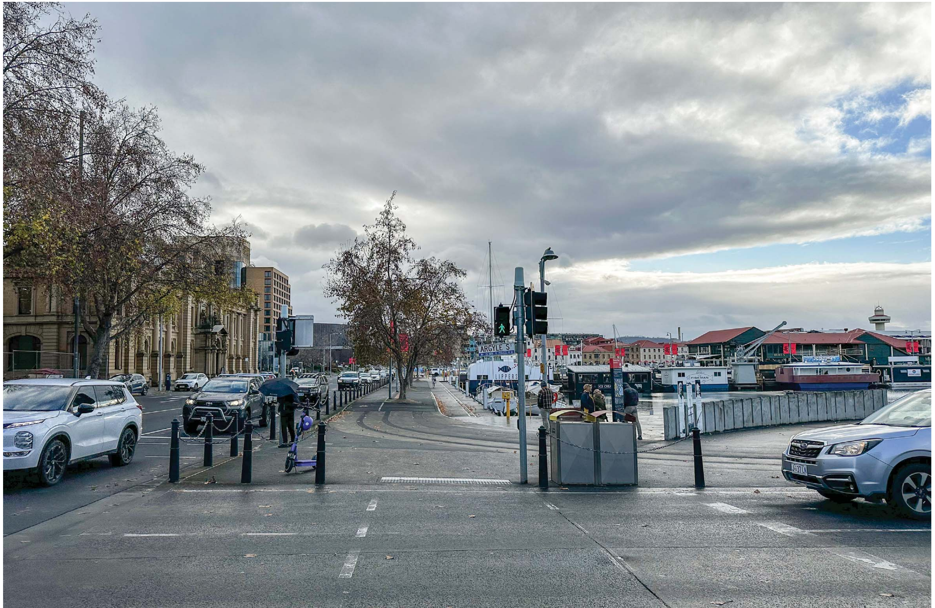
MAC POINT VIEW 8 DAVEY ARGYLE EXISTING VIEW