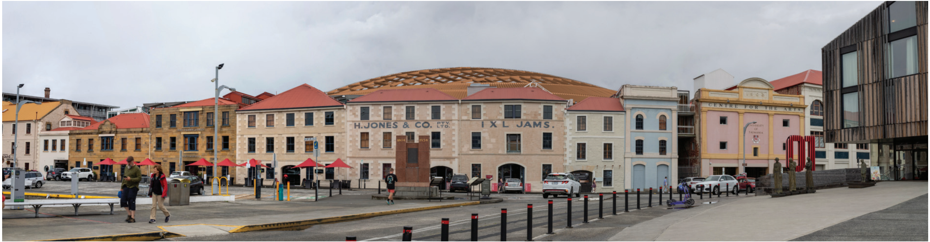
PROPOSED VIEW WITH STADIUM BUILT FORM