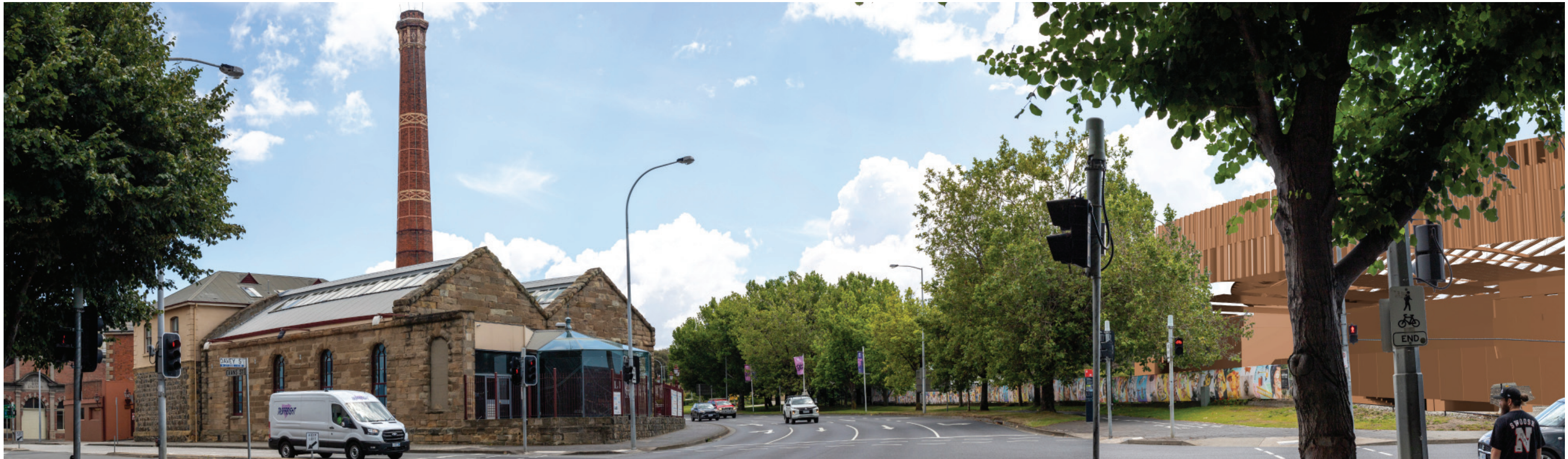
PROPOSED VIEW WITH STADIUM BUILT FORM