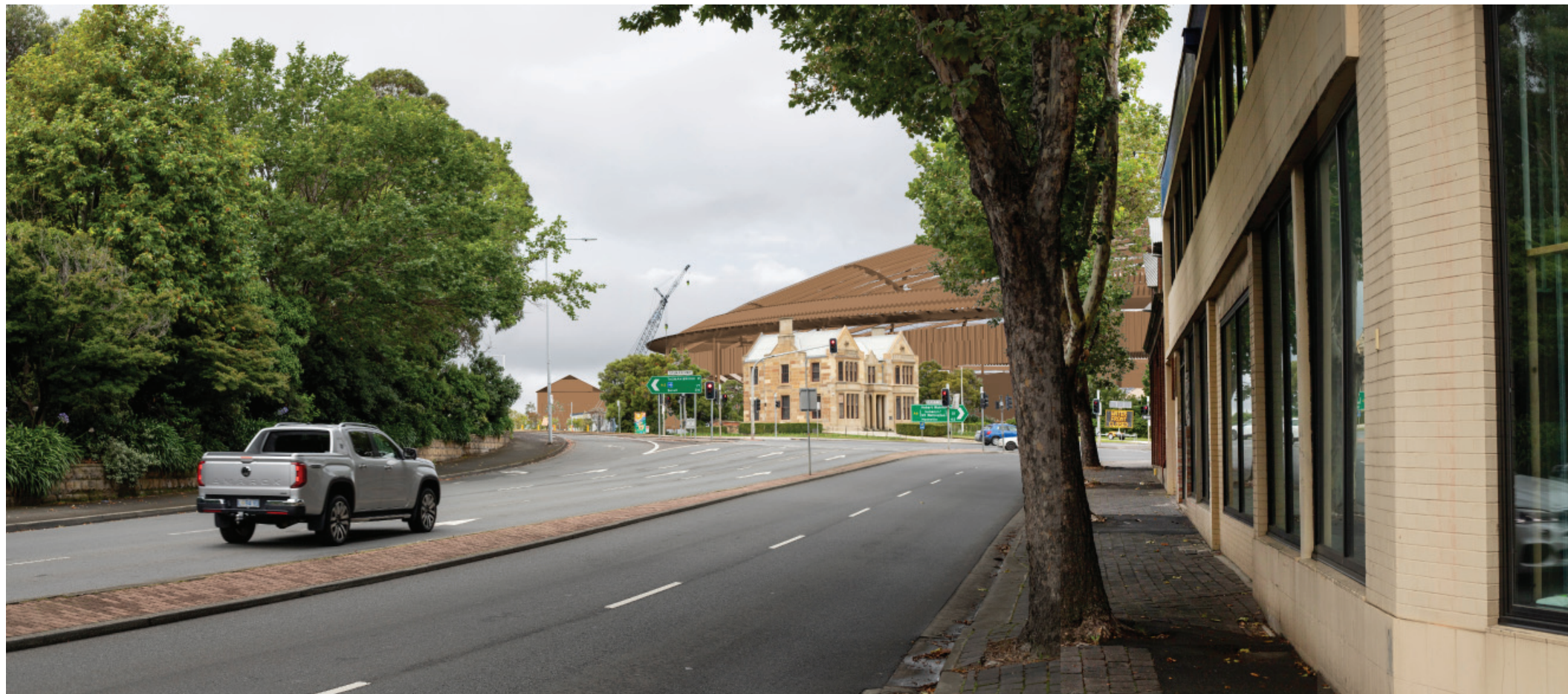
PROPOSED VIEW WITH STADIUM BUILT FORM