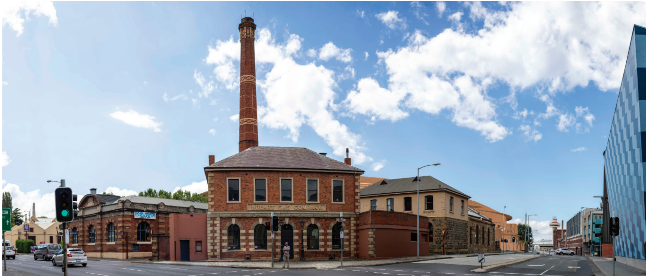
PROPOSED VIEW WITH STADIUM BUILT FORM