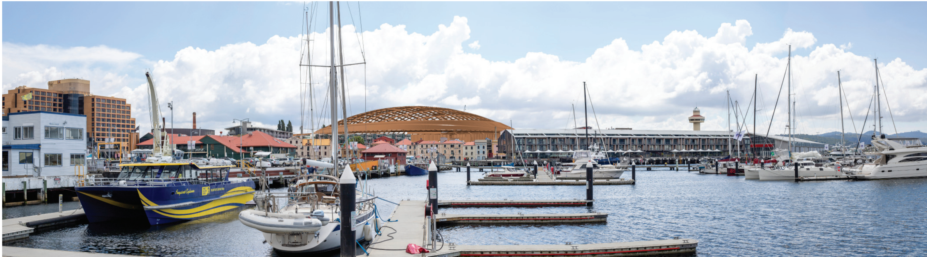
PROPOSED VIEW WITH STADIUM BUILT FORM