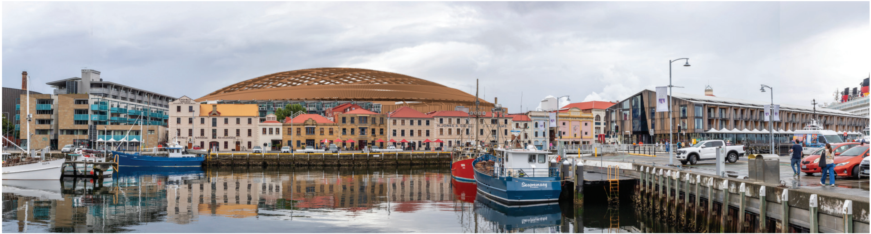
PROPOSED VIEW WITH STADIUM BUILT FORM