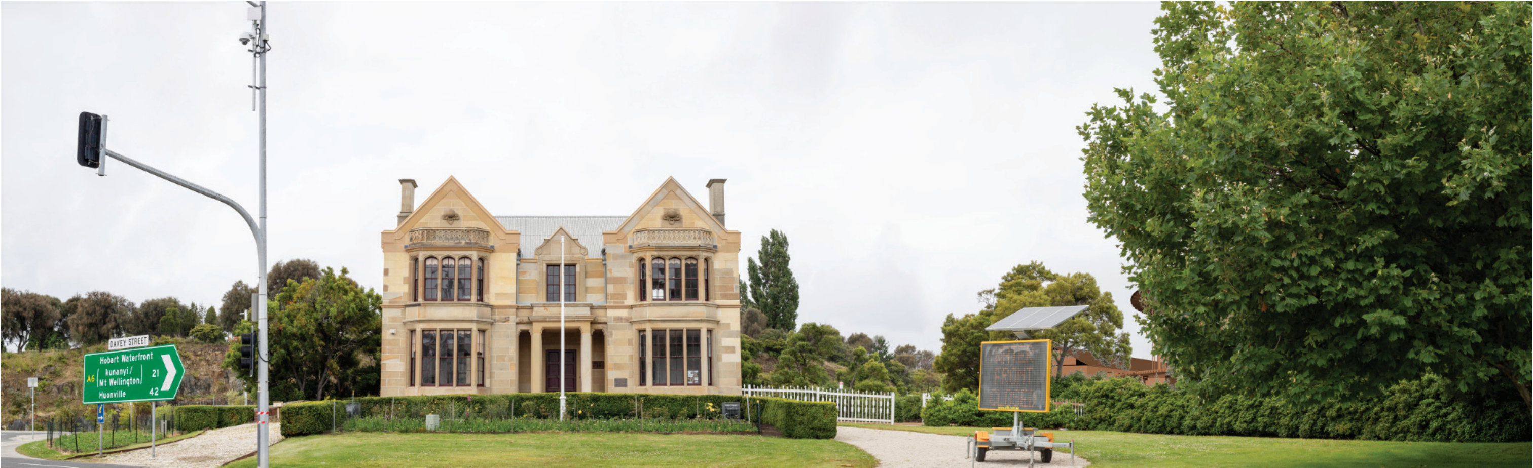
PROPOSED VIEW WITH STADIUM BUILT FORM