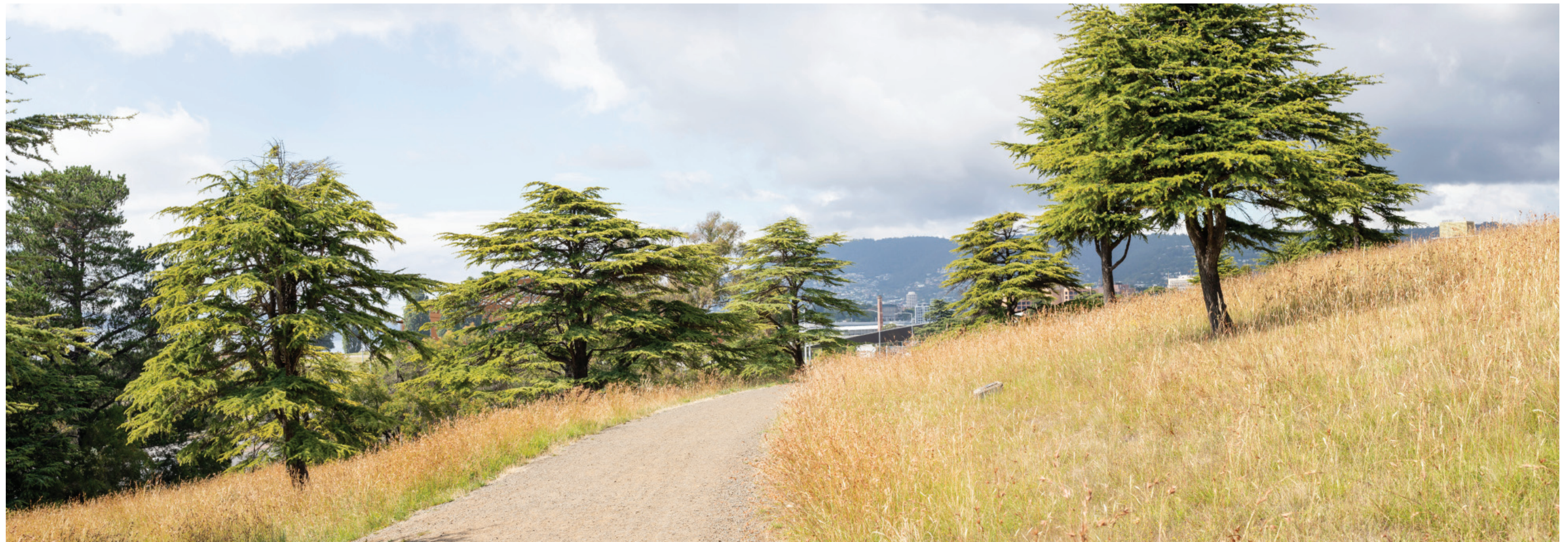
PROPOSED VIEW WITH STADIUM BUILT FORM