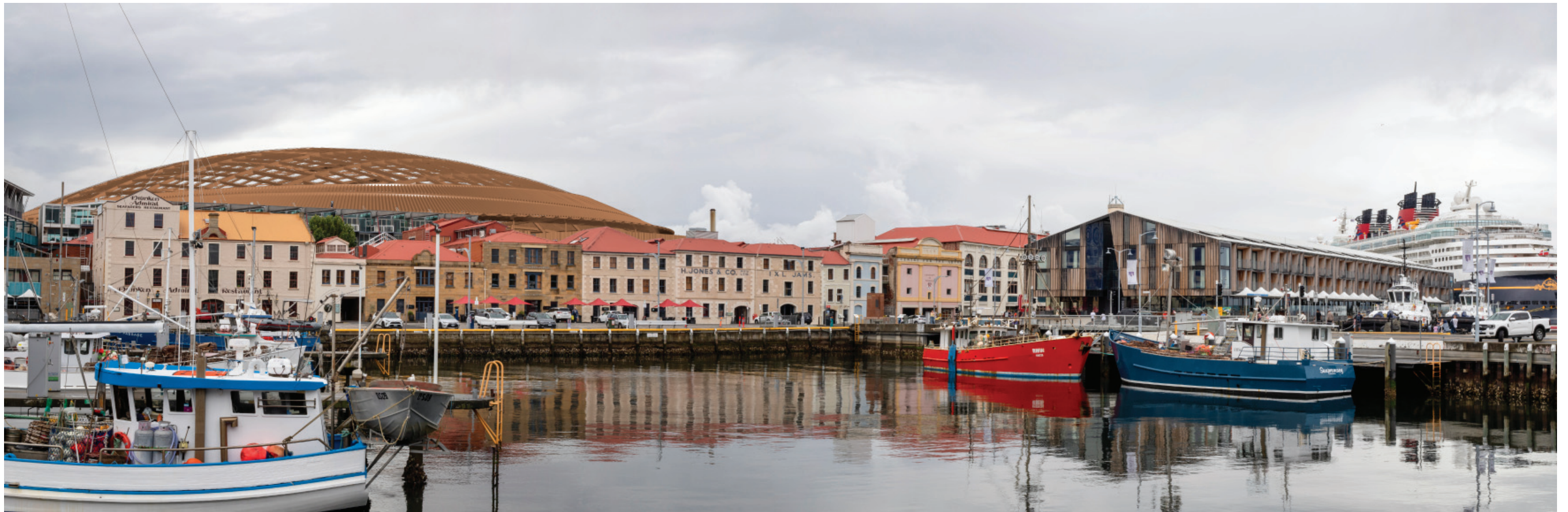
PROPOSED VIEW WITH STADIUM BUILT FORM