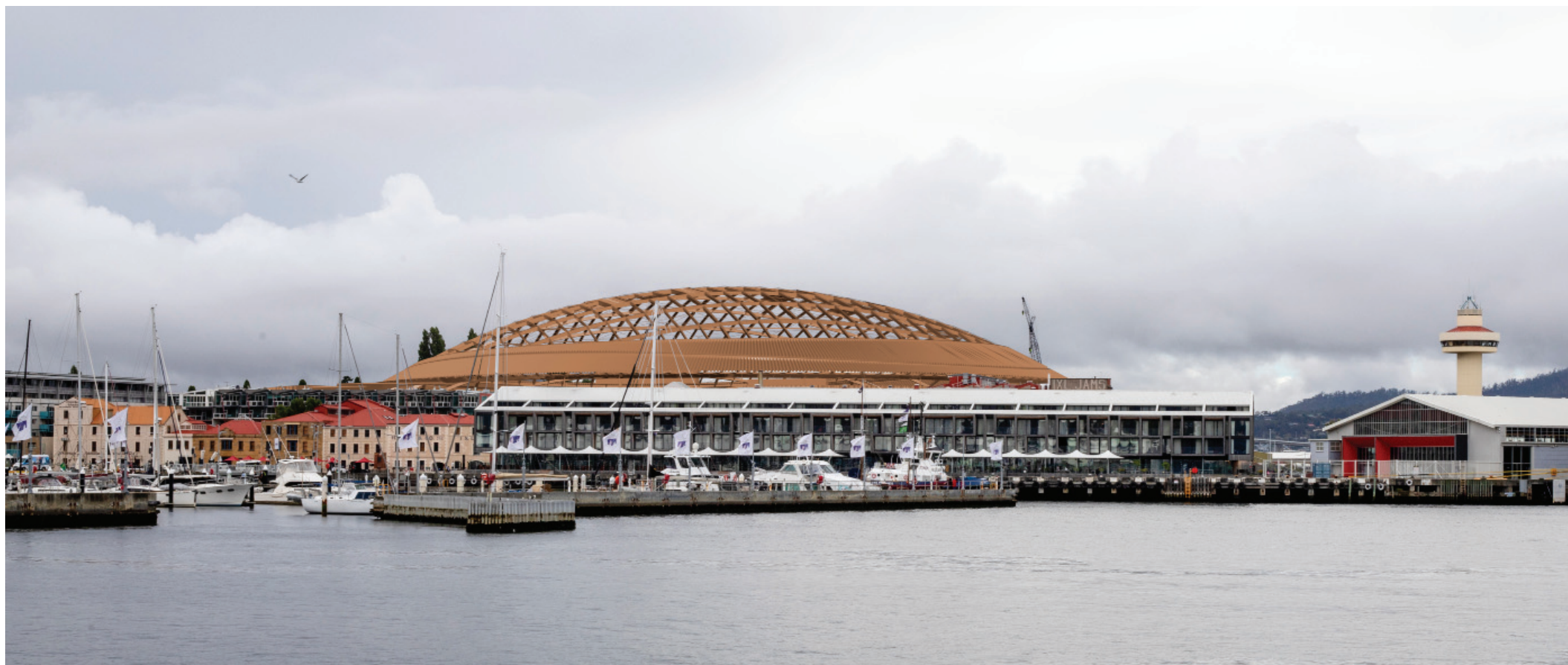
PROPOSED VIEW WITH STADIUM BUILT FORM