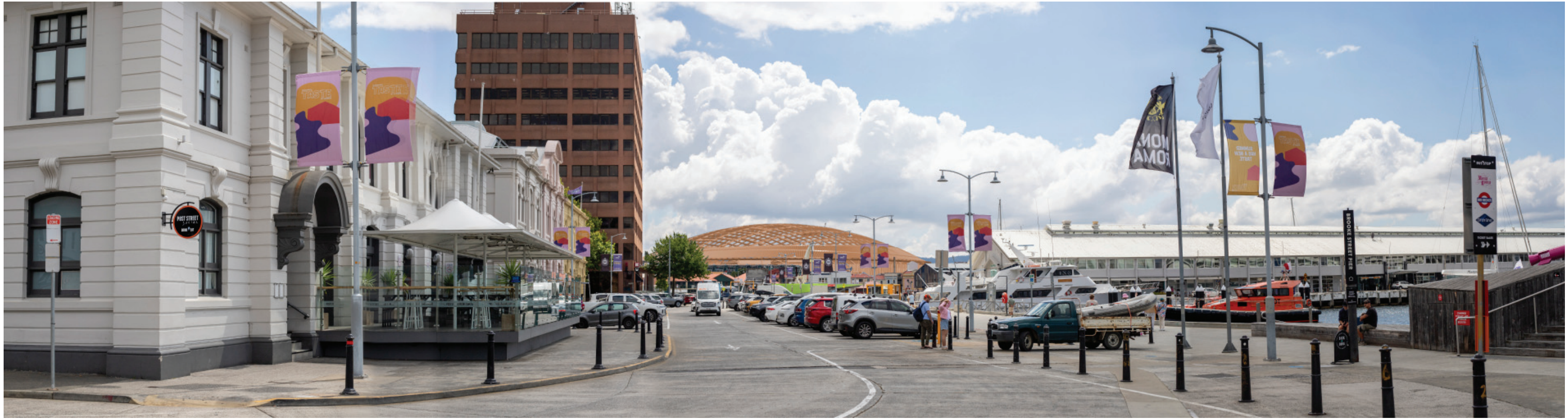
PROPOSED VIEW WITH STADIUM BUILT FORM